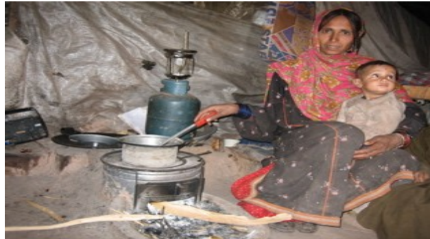
An energy efficient stove provided by FROK enables women in camps to cook without filling their shelters with fumes

85 East Parade, York YO31 7YD: jonathan@jfrench85.fsnet.co.uk 423522 Oxford Contact: elmasinclair@yahoo.co.uk